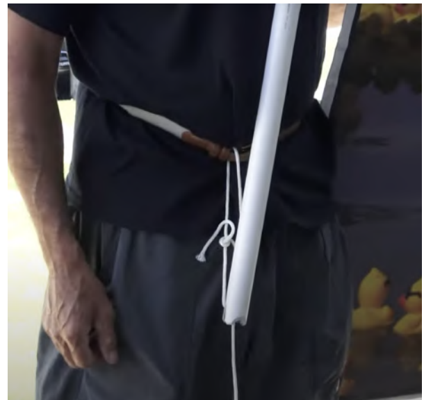
Rope, belt, and notch system