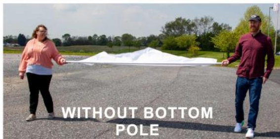
Additional horizontal PVC pipe